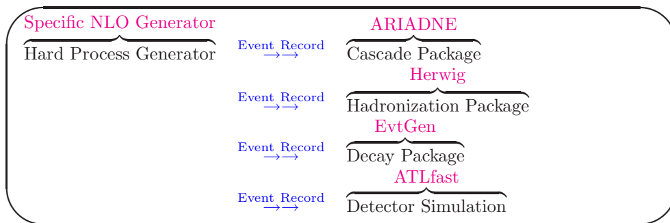
Figure 1: HepMC supports the concept of modularised event generation (illustrated above) by containing sufficient information within the event record to act as a messenger between two modular steps in the event generation process.

HepMC is an object oriented event record written in C++ for Monte Carlo Generators in High Energy Physics. It has been developed independent of a particular experiment or event generator. It is intended to serve as both a “container class” for storing events after generation and also as a “framework” in which events can be built up inside a set of generators. This allows for the modularisation of event generators—wherein different event generators could be employed for different steps or components of the event generation process (illustrated in Figure 1). 2